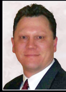
Kevin Nash, MF $6.4 Million